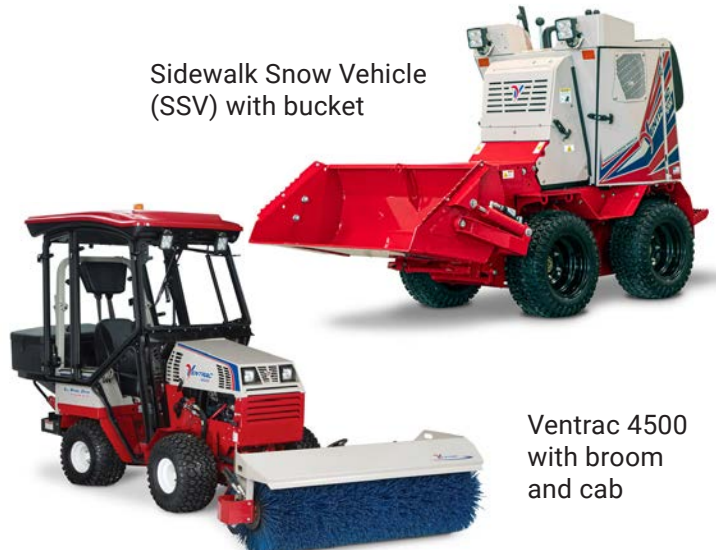
Ventrac 4500 with broom and cab