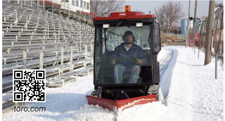
Toro Outcross with loader arm & BOSS SK box plow

The Toro Polar Trac System transforms the Groundsmaster 7210 into a powerful snow removal machine. The patented Polar Trac System is ready for all winter conditions with its heated hard cab, innovative rubber track system and quick-connect attachments. With its zero turn radius capabilities, you can remove snow from the tightest areas.